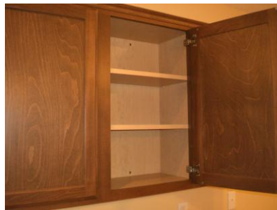
(Interior wood grained)